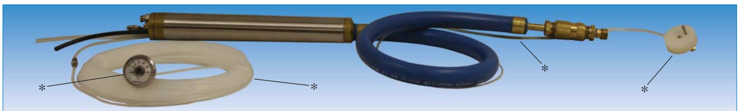
F.A.P. Plus ZW (TR-51640). The F.A.P. Plus (TR-516) is similar to the above, but does not come with the ZW option and PPS gauge (items marked with *).

Maintenance: Biofouling may occur because the hydrophobic element is positioned at the air/product interface. If fouling occurs, the element can be cleaned using a soft brush or replaced by unthreading the bypass element and installing a new hydrophobic element.