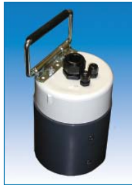
TR-764 (Shown mounted to well.)

Well Clincher (TR-76250 / 76450) - Serves as a well seal and pump support. It simplifies hose connection. A retractable handle provides for easy installation or removal of the pump system.