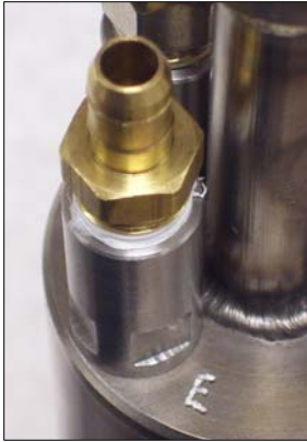
Exhaust Hose Barb 3/8 in O.D. x 5/16 in I.D. Nylon Tube