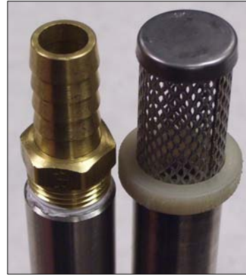
Fluid Discharge 1/2 in I.D. Hose Barb 1/2 in BUNA-N Hose

Warning: All tubing or hoses attached to the pump must be secured with an appropriately sized hose clamp.