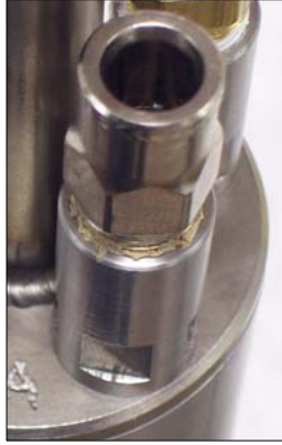
Air Inlet 1/4 in O.D. Push-To-Connect 1/4 in O.D. Nylon Tubing